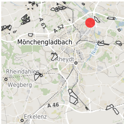
Location in municipality