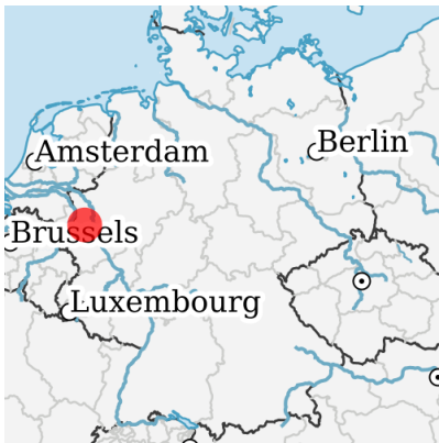
Location in germany