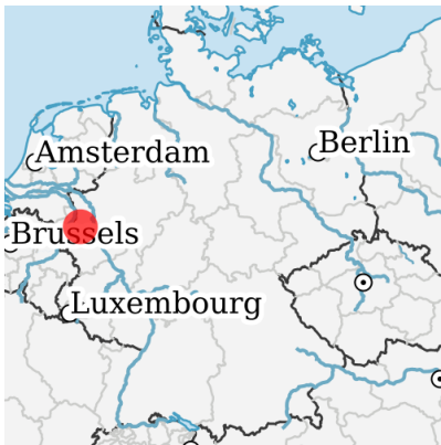
Location in germany