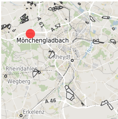
Location in municipality