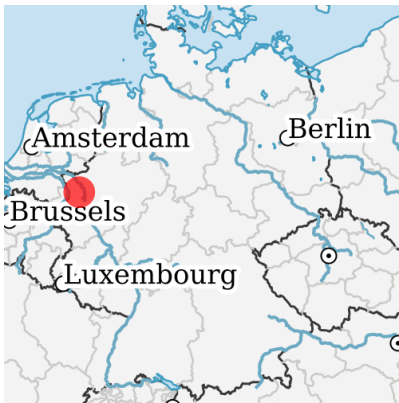
Location in germany